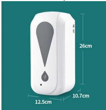
No-Touch Wall Mount or Tabletop Sanitizer Dispenser

Liquid capacity: 1200ml Size: 12.5*10.7*26cm Activation Distance: 5cm USB Rechargeable Battery Color: white, pink Tabletop: $14.90 Wall-Mount: $19.90 .(Stand: $15.90) MOQ: 20