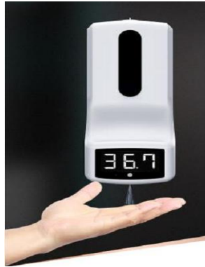
No-Touch Sanitizer Dispenser w/ Built-in Forehead Thermometer

Liquid capacity: 1000ml Size: 11.9*13.3*28cm Activation Distance: 5-10cm Power : USB-C, 5V Measurement range: 0~50°C Response time: 500ms $44.90 .(Stand: $15.90) MOQ: 6