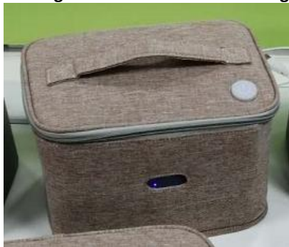
Folding UV-C or Ozone Sanitizer Bag

Sanitizes Baby Bottles, Phones, Masks w/o the need for chemicals; Size: 6x6x10", Folds for travelling 6 UVC Light Beads: Wave Length: 260-275nm Power: 5V/1A, 3.9W UVC type: $24.90 Ozone type, w/ hoses: $39.90 MOQ: UVC-60; Ozone-100