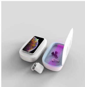
UV-C Ear-Bud Sanitizer Case

Sanitizes ear-buds or hearing aids in 5 minutes w/out chemicals Also use for aromatherapy Wireless charging: 5V, 10w 2 UV-C Light Beads Wave Length: 260-275nm $11.90 MOQ: 30