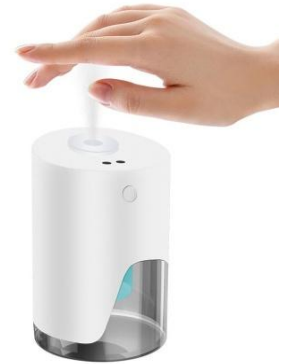
Touch-less Disinfectant Mister

Generates a gentle mist of inexpensive rubbing alcohol OR NON-TOXIC HClO disinfectant w/o touching unit. Use to sanitize hands, phones, keys, etc. Auto mists & then shuts off. Rechargeable battery (USB) Compact: 3x3x4.5" $12.90 MOQ: 100